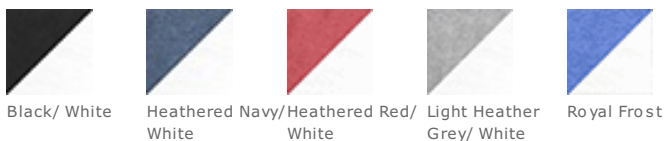
Black/ White Heathered Navy/Heathered Red/ White Light Heather Grey/ White Royal Frost