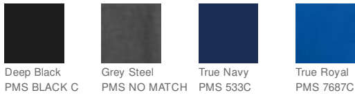
Deep Black PMS BLACK C